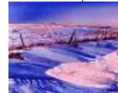
Winter Scene –snow banks