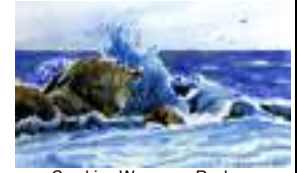
Crashing Waves on Rocks