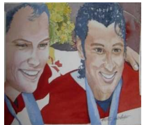
Closing Ceremonies at Vancouver (Ryan Getzlaf/Roberto Luongo) by Patricia Lawton

Tool & Supplies: You will need to bring ... Brushes: Nos. 4, 6, 8 and a 1 ½-inch Hake. Paints: Winsor & Newton brand Transparent Cobalt Blue , Aureolin Yellow , Rose Madder Genuine and Permanent Winsor Blue (red shade) and Cadmium Red . Palette: By Robert E. Wood (important to have this palette) or 4 small containers to mix colours in for doing large washes. Paper: 140 or 300 pound D’Arches watercolour paper; one or two 30 x 22” sheets (Patricia uses 300 pound). Easel: Can be Acrylic (buy at a glass store) to tape your paper to - size approximately 15 x 24”; buy a very thin “ply” otherwise it’s too heavy to pack around. Miscellaneous: Roll of ½-inch masking tape, Winsor & Newton brand Art Masking Fluid ; sketch book (50 or 60 pound paper is perfect - don’t buy ‘heavy’ paper); HB pencils; white plastic eraser (Mars is a good make). These are the supplies Patricia uses. You can also use your present supplies, but it is important to have the 3 transparent colours. Permanent colours don’t work well for scrubbing out or layering over.